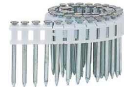
Label for 5323 HP