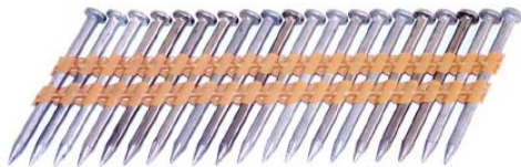
Boxes of 5323P as Shipped