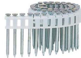
Label for 5323 HP