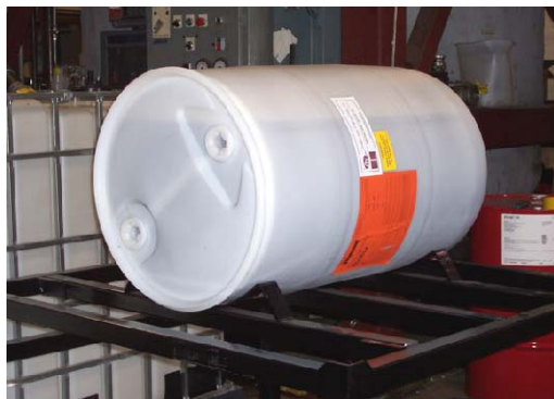
F6400LVR - 55 gallon Plastic Drum Container