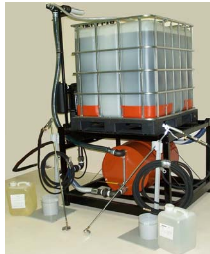
F6400LVR - 275 gallon Tote Container Sealed Gravity Feed Supply Setup