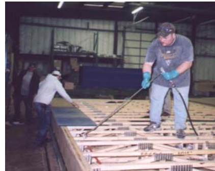
Typical F6400LVR Application