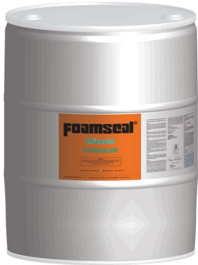
Figure 3 - F6400-LVR - 55 Gallon Drum