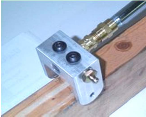
Figure 1 - Single Bead Application Head