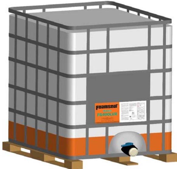
Figure 4 - F6400-LVR - 275 Gallon Tote