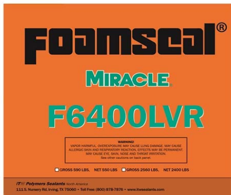
Figure 5 - Miracle Foamseal F6400-LVR Product Label