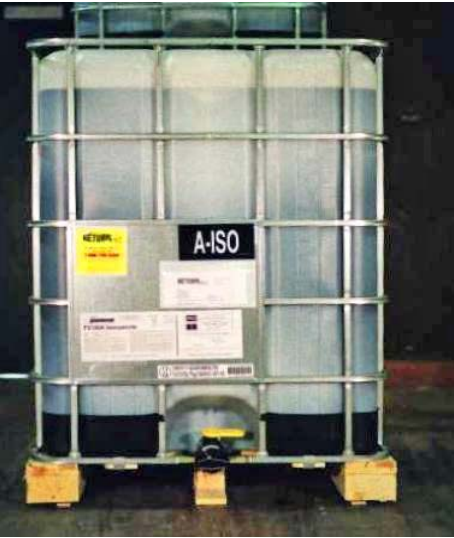
F2100 ISO NT Black Tote