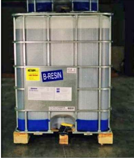
F2100 Resin NT Blue Tote