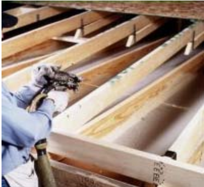
Two Component Urethane Adhesive