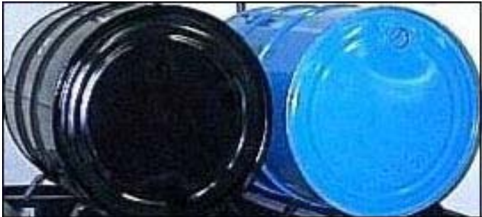
55 Gallon Steel Drums