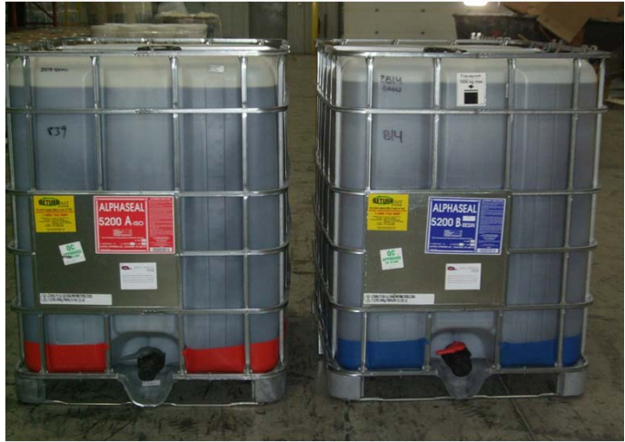
AlphaSeal 5200 is shipped in 275 Gallon Caged Totes or 55 Gallon Steel Drums