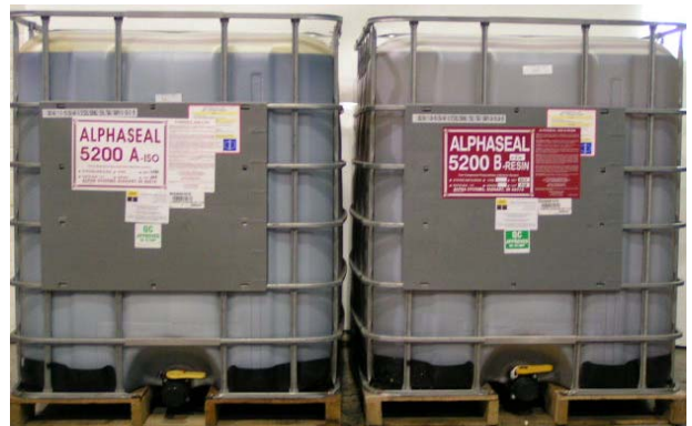
AlphaSeal 5200 is shipped in 275 Gallon Caged Totes or 55 Gallon Steel Drums